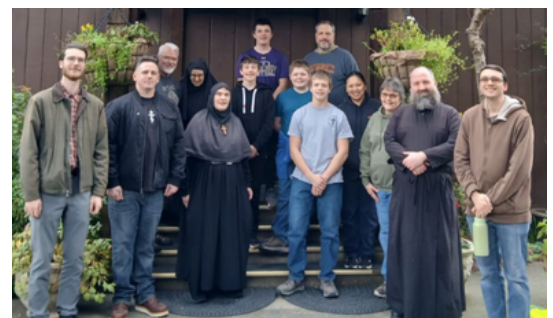
Still smiling after a hard day's work!