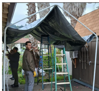
What do you mean, we're not finished yet?