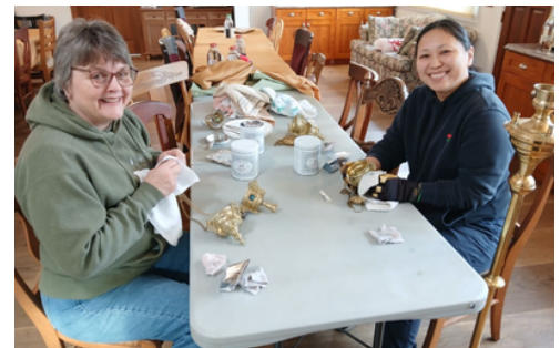
A lampada polisher's work is never done!