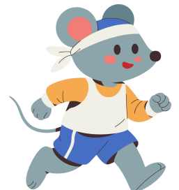
I'm outta here!