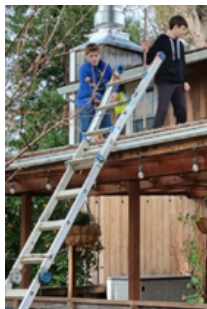
Okay, we're up here. Now what!?