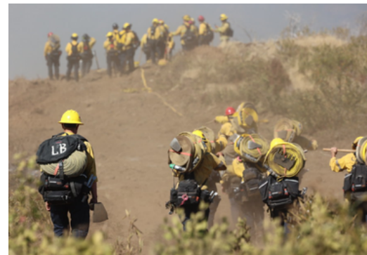
Thank you, firefighters! We are grateful!!