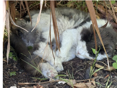
NOTHING is worth losing sleep over!

After featuring our INDOOR kitties last month, we didn't expect our OUTDOOR kitties to take it lying down. We were wrong!