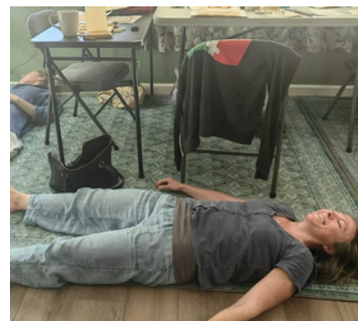
This is exhausting work!