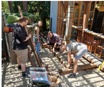
From this ...