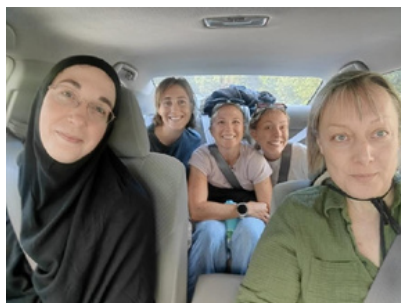
On a mission!