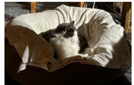
Philly - What??