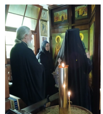
His Eminence helps out the choir!