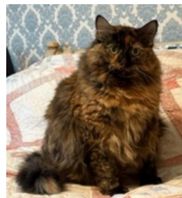
Goolya - My tail is beautiful no matter what!