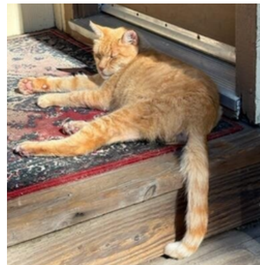
Simba - I need a little more room for my tail