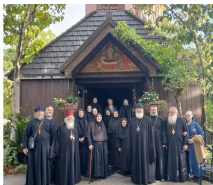
His Eminence, his entourage, and the sisters