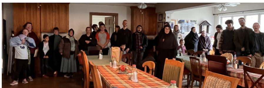
Food always tastes better after hard work - at least, that's what we tell our work parties!!!