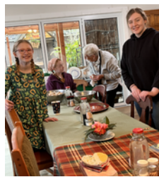
A happy cooking crew!