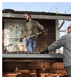
All hands on deck - the deck roof, that is!

Our dear friends from St. Athanasius Church Sacramento decided to share the work (I mean, fun!) of their annual work party with our other dear friends from Holy Cross, Sacramento.