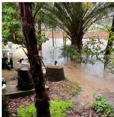
A tad too close to the koi pond pumps for comfort!