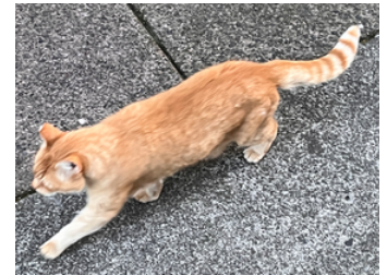
Simba - on a mission, can't stop to talk!