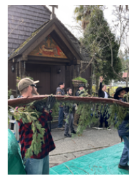
One branch down. HOW many to go?