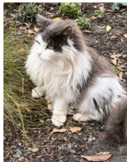
Philly - Have you noticed how regal I am?