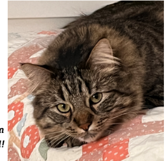
Frisco - I'm SO bored!