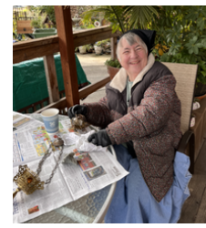
A polisher's work is never done!