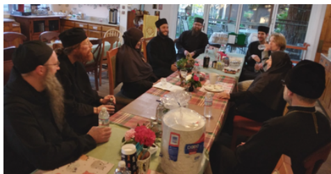
A veritable sea of black!