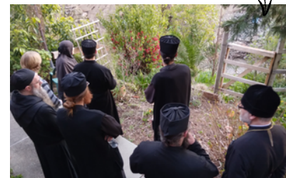
Looking at the lower garden and the river where it's SUPPOSED to be!