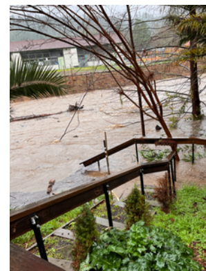
Where did our lower garden go?!