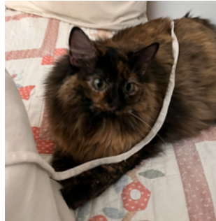
Goolya - resisting temptation, is HARD!!