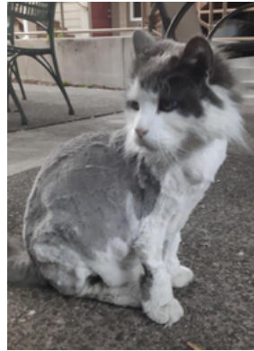
PHILLY: The great thing about being me is that I'm incredibly handsome and wonderful with and without all that fur!

It's that time of year again - it's getting hot and the critters need to stay cool.