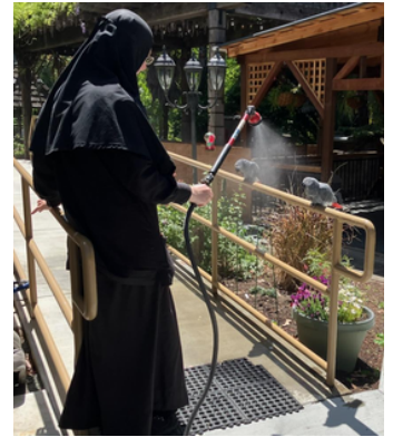
PETIE & SUNRISE: We love the spray and all the attention, but don't tell our servant that!