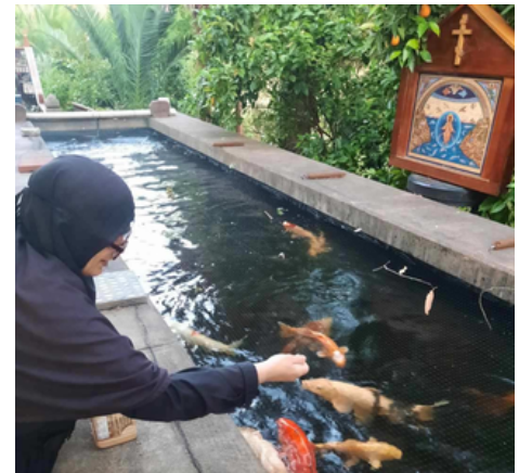
THE KOI: The warmer our water gets, the faster our metabolism gets & the more we need to eat. At least, that's the story we've told the nuns, and we're sticking to it!!!!