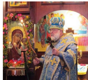
Our Chief Shepherd