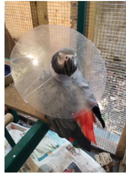
If I have to wear a collar, make it a JEWELLED collar!

You've seen Pearl in these pages before. Now meet Rosie, who has been gracing us with her presence lately!