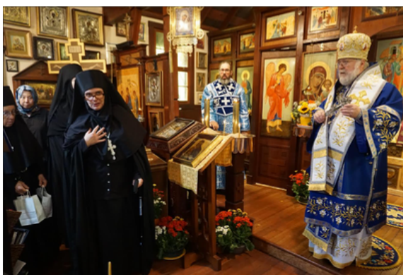
His Eminence and a nun or two!