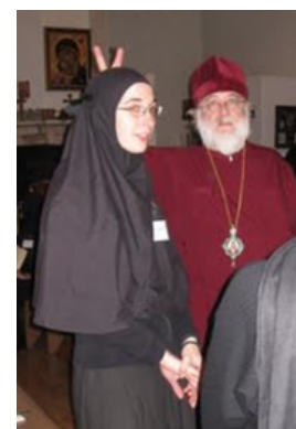
We couldn't resist!