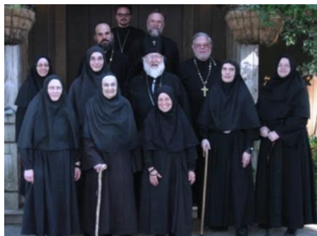
In the early years