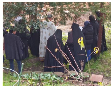
Blessing the Napa River