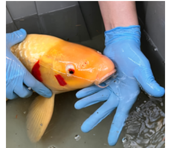
I hope the treatment ends with a treat!