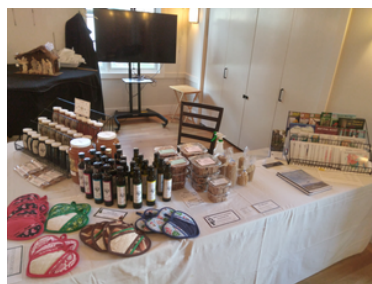
All set up ...