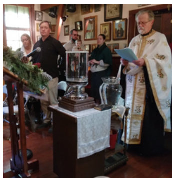
The indoor blessing of the waters