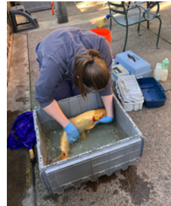
Whoa! My world just got very small!