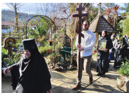
... and the whole monastery