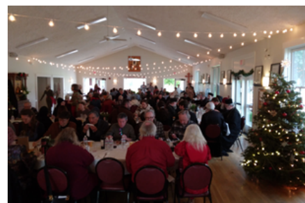
& plenty of potential customers!