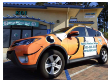
Not the very best way to go if you're trying to be inconspicuous!