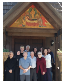
Making up for our lapse of judgment by including a nice family photo!