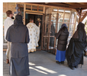
... and don't forget the birds!