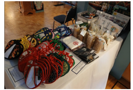
Yes, we DID bring more than just lavender!