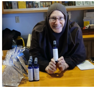
Smile, you're on Candid Camera!