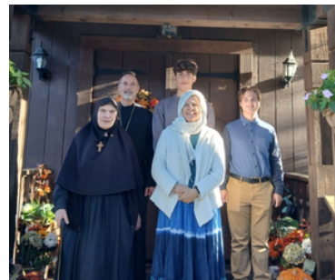
Oops! We already used up the Candid Camera line!