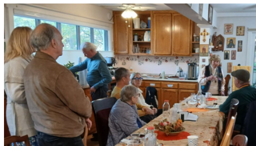
Thankful to God for friends, family, and all His many blessings!