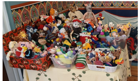
A VERY SMALL sampling of our friend Liubov's wonderful handmade dolls