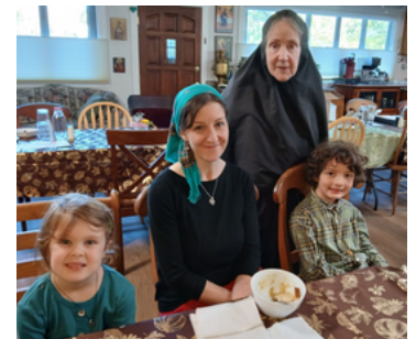
Training up the next generation!