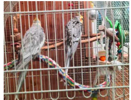
Don't worry, Bloop. We'll get used to these names in time!

Since Boaty is an scientific exploration vehicle, we thought Boaty was the obvious name for the larger, more adventurous of the two cockatiels. As for Bloop? Well, we'll just have to teach her to say it!