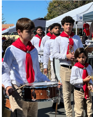
Wow! We weren't expecting a band!