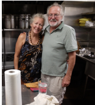
One birthday girl, two great cooks & all-around good eggs!