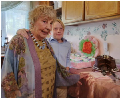
One young birthday boy & one young-at-heart birthday girl!