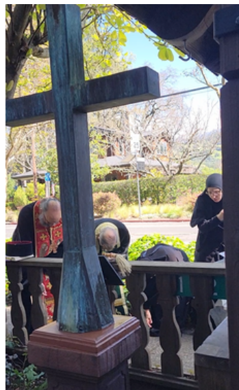
Before Thy Cross, we bow down in worship, O Master