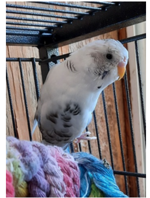
Bubbles: equal parts sweet & beautiful

We are sorry to report that Bubbles, our parakeet, has died. When she came to us in 2016 her name was Crackle (as one of a trio of parakeets that we dubbed Snap, Crackle, and Pop). Snap and Pop died a couple of years after they came, and her caretaker decided she needed a new name. Not sure where the name "Bubbles" came from, but that has been her name ever since. We will miss her sweet voice and chirpy (quite literally 😊) personality. Goodbye, Bubbles. You were a great bird!