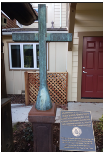
The Cross in its new home