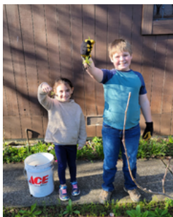
Weed patrol extraordinaire!