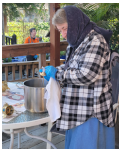
A silver cleaner's work is never done