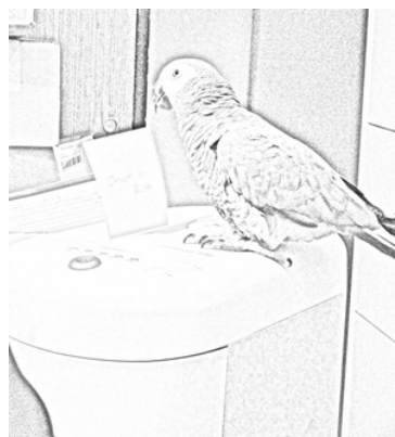
Petie the office helper - I'm the best paper shredder in the business!

The Monastery Cats Coloring Book was a hit - at least with the cats, although of course, they wouldn't admit that. The next volume will be Monastery Birds Coloring Book (of course). It's not finished, but here are a couple of examples to whet your appetite!