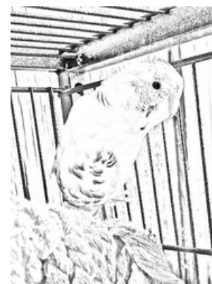
Bubbles - what do you mean, "Watch the birdie"?