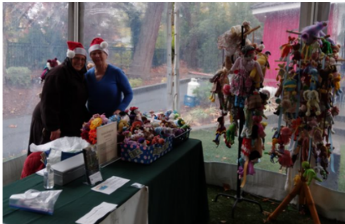
Santa's got nothing on us!