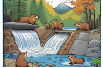
Our beavers' stunt doubles

In addition to the feline, fish, and feathered members of the monastery zoo, our riverside property is home to many other creatures: heron, ibis, skunk, racoon, opossum, and even fox have been spotted on our grounds at various times.