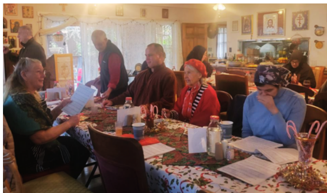
Singing for our supper - Tra la la la