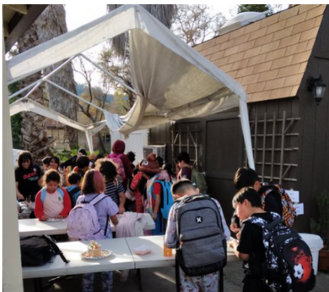
Sorry, kids, we CAN'T do this every week!

Cookie Decorating with the School Children - Dec 15