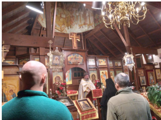
Christ is born! Glorify Him!