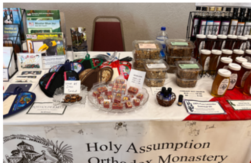
Ready to go!

November 16, Holiday Market, Nativity of Christ Church, Novato