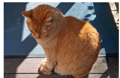
Wake me up when this is over.