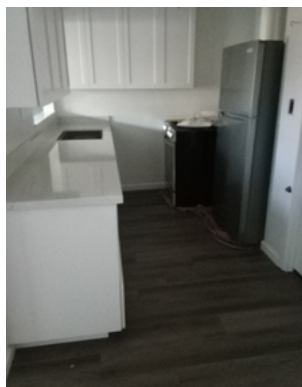
Didn't even have to crop anything out of this one!