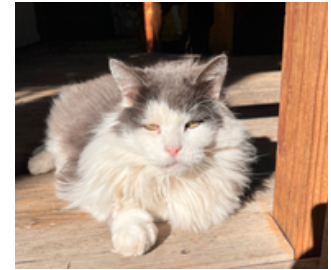
You woke me up from my beauty sleep. This had better be good!

Our deep apologies to our cats, who are understandably miffed that we have been featuring BIRDS instead of them!