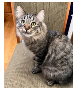
Okay, I posed for you. Can I have a treat now?