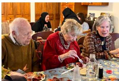
We gather together