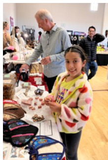
So much to look at. So little time!