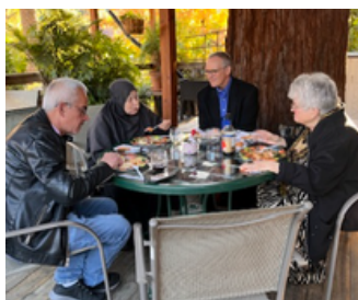
to ask the Lord's blessing!