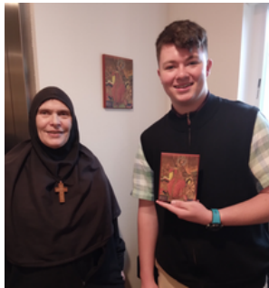
In front of the icon of St Katherine