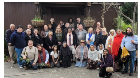
Friends old and new - the two best kinds!

St. Demetrios, Concord, Church Group, March 18