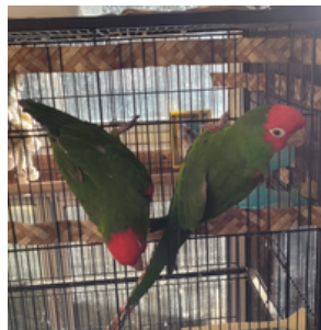
When's MY turn to be head up?

Petie and Sunrise are continuing to get along, and so is everyone else! Pixley and Shannon have become fast friends. Frisco has graciously decided he can endure Goolya (never mind that she was there first). Even Simba and Philly have been seen hanging out together. If this keeps up, we're going to have to widen our net to get enough material for the Zoo Update!