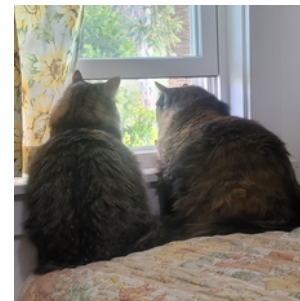
We'd rather watch television