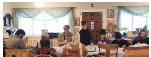
The QUICK way to get the newsletter out!

Sts. Peter & Paul, Ben Lomond, Youth Retreat, March 3-5