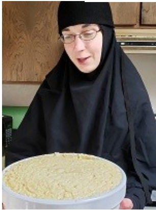
I LOVE making dough