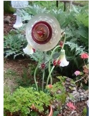
The inorganic garden