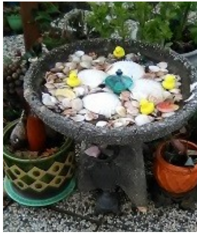
Who's bathing in here? Hint – Ernie from Sesame Street sang about their cousin.