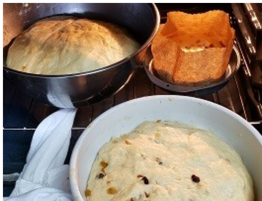
I hope these come out!