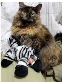
Just so you know, this is MY zebra!

Carrying capacity: the maximum population size of a species that an environment can sustain indefinitely, given the food, habitat, water, and other necessities available in the environment.