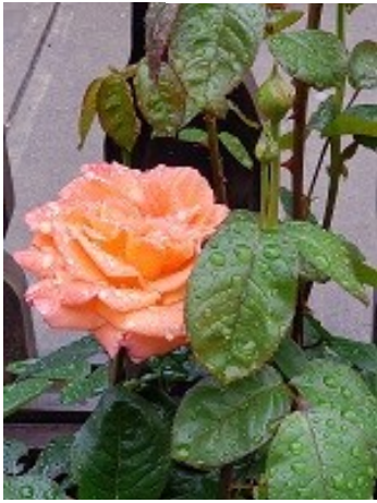
A rose by any other name