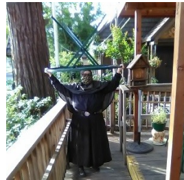
If table lifting were an Olympic sport, we'd be all set!