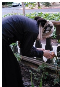
Here's a good spot ...