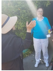
And we thought WE were bringing the ray of sunshine!

Taking Mother's Day to the Mothers while still under quarantine