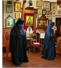
But it's okay.