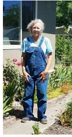
Stop gardening for a minute and let us wish you Happy Mother's Day!