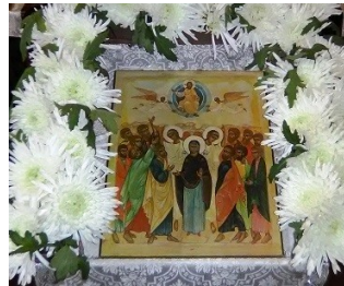
No matter what's going on, Christ HAS ascended in glory!