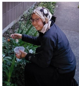
and another good spot