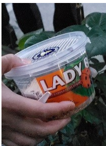
Let us out!!!

Just because they're smaller than a thumbnail doesn't mean the ladybugs aren't important members of our community!