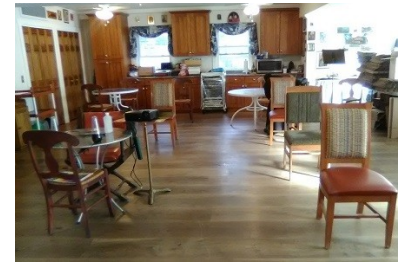
Like I said, there WERE parishioners here, honest!