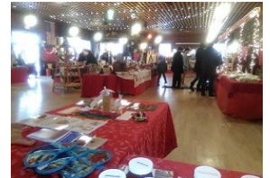
The brightness of the season?