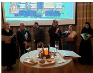
Now for our next selection ...