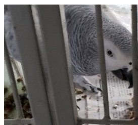
Sunrise – I may be in prison, but the food is marvelous!