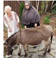
Can I take him home?

Nativity of the Holy Virgin Menlo Park December 7