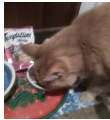
Simba – The treat bag says it all!