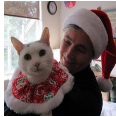
Cookie – I get extra treats for this!