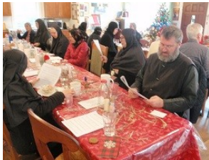
I'm sorry. HOW many French hens?