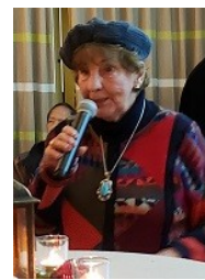
Putting in a good word for the nuns