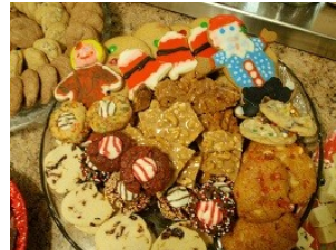
Desserts worth waiting for!