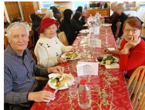
What's for dessert?