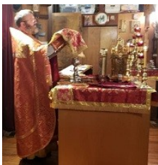
Vesperal Liturgy of St. Basil