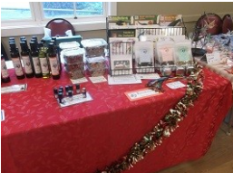
Is this festive enough?

St. Seraphim Cathedral Santa Rosa November 30