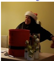
Santa's helper is back!

The December 19 th Carols & Canapes fundraiser for the new St. Nicholas House project was a wonderful success! Nearly 100 people – our Calistoga neighbors, as well as friends from Santa Rosa and Fairfield – joined us at Indian Springs Resort that Thursday evening. Thanks to the generosity of many local businesses, our guests enjoyed wine and light hors d'oeuvres while purchasing tickets for generous raffle prizes that included hotel stays, restaurant gift cards, and (of course!) wine and wine tastings. The sisters presented information on the St. Nicholas House project, while a group of singers from Santa Rosa offered a selection of Orthodox Christmas hymns, and another friend played seasonal selections on her harp. The evening raised a total of $12,325 for our project and helped us meet the $20,000 matching gift from a local business owner. We would like to thank everyone who participated as a guest, a sponsor, a musician, or a contributor in any way. Glory to God for His gifts and for the love He shows us through our friends.