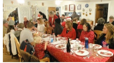
12-Course Christmas Eve Meal – Save room! We've got five courses to go!