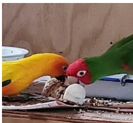
Cha Cha & Pixley – Birds that eat together stay together!

Every year the zoo denizens look forward to their special treat that they get in honor of Christ's being born in a manger. At least, we assume they do. At any rate, WE look forward to giving them the treats, and THEY do enjoy eating them!