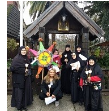
See? We ARE star singers!