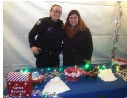
Filling Santa in on who's naughty or nice?