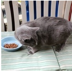
Balou – Let me eat in peace!