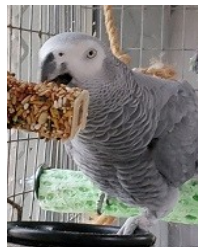
Petie – Yum! Bird candy!