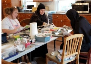
Decorating Cookies – Don't have TOO much fun!