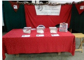
Today's offerings – cookies, cookies, & cookies

Nativity of the Holy Virgin Menlo Park December 7