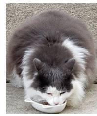
Philly – Life is good 😊