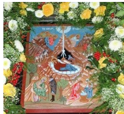
A star showed Thee Whom nothing can contain contained within a cave.