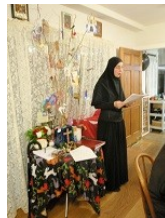
Leading Carols – Tra la la la!