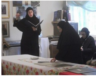
Choir Practice – Once more with feeling!