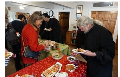
Rule 1 – Never let your guests starve!