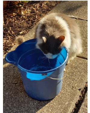
Work smart, not hard.