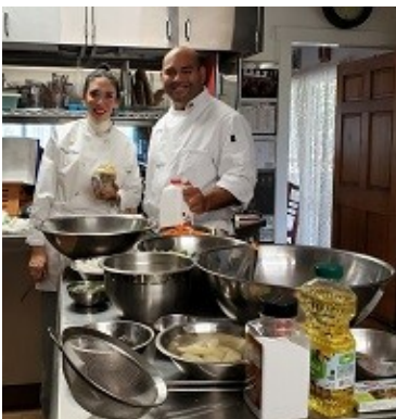
Our kitchen is happy to have cooks who appreciate it!