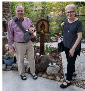
Can you spot the (adorable) puppy?