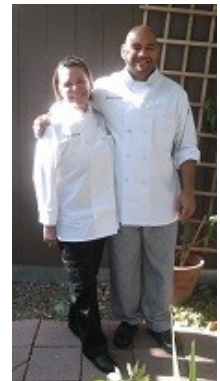
We DO let them out of the kitchen at times.