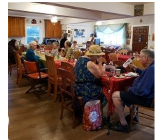
Rule 2 – Never forget Rule 1!