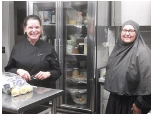
And we are happy to have friends who cook for us!