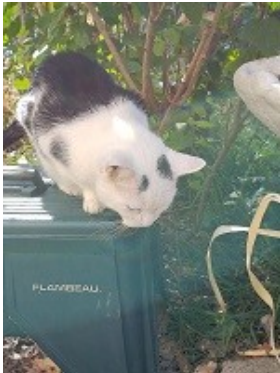
How to get a drink?