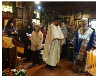
His Eminence, the clergy, and the faithful