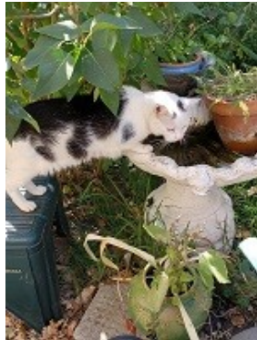
I think this will work.