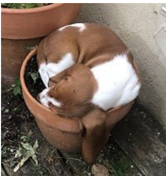
Molly - I think I'll just plant myself here and take a nap.