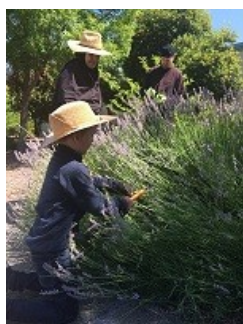
Start them young.

Our friends from St. Seraphim Cathedral (Santa Rosa) and St. Nicholas Church (San Anselmo) made this year's lavender harvest a joy and a success! Thanks so much! Looking forward to next year!