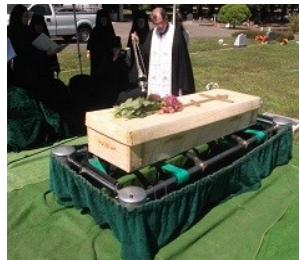
Looking upon my grave, remember me with love and beseech Christ that He establish my soul with the righteous.