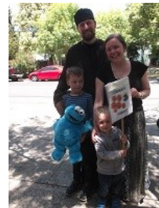
Can Cookie Monster come back to Norway with us?