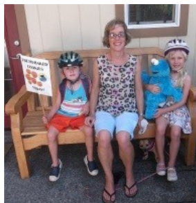
We want cookies!