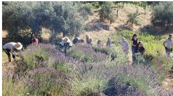
Okay, back to work!