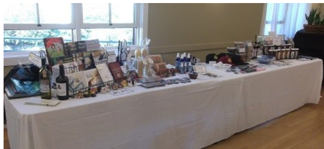
Father, is there another table we can use?

At St. Seraphim Cathedral on their Feast Day, July 19