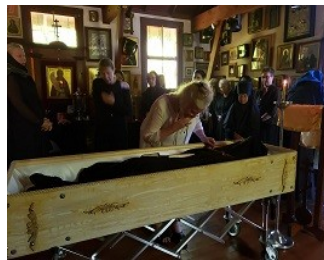
Come, brethren, let us give a last kiss to the dead, rendering thanks unto God ...