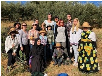
Hey, everyone. Photo break!