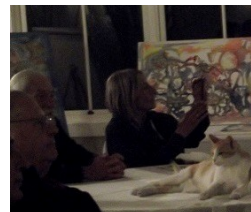
Great cat ...