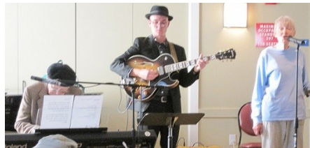
Great band ...