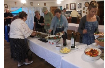
A light repast