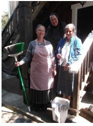
Have broom, will travel.