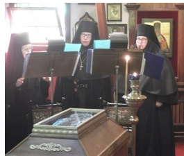
Let us sing unto the Lord!