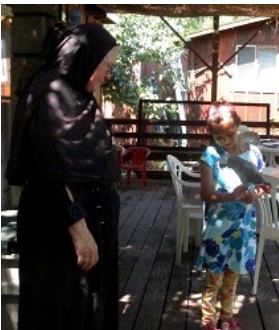
Sunrise is in there somewhere, we promise!