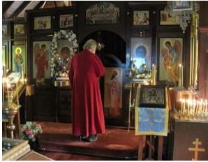
His Eminence enters the church.