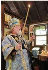
The blessing of the Lord!