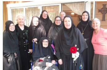
A somewhat smaller attendance than on the Feast proper!