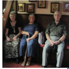
Three of our stalwarts ☺