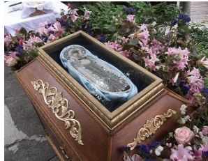
Neither the tomb nor death could hold the Theotokos!