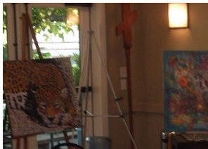
Great art ...