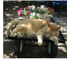
I'm exhausted from all my hard work!