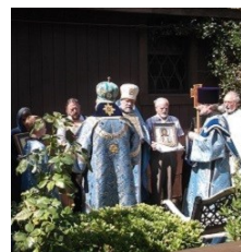
The Cross procession