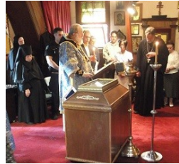
His Eminence & the faithful