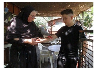
Look, Ma, one hand!