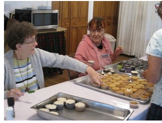
It's a tough job, but someone's got to do it!