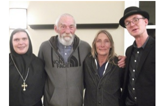
Great artist, great lady, great guitarist ... & a nun