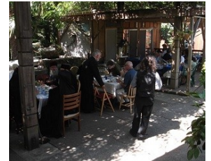
Festal meal & fellowship