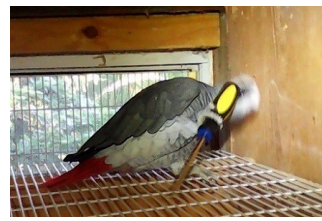
I think I've got it!