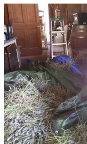
And that's just a part of the yield!