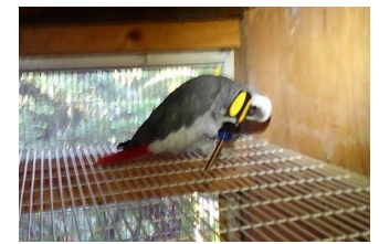
Would someone hand me a screw?