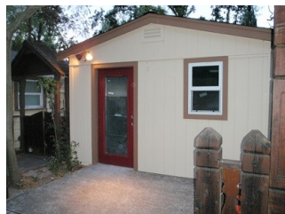
This WAS our garage. REALLY!

As this is being written, the final touches have been made on the interior of the bookstore, and we are starting the moving process. We hope to have the bookstore up and running within a week, and have every expectation of its being fully functional before our Dormition festivities. If that weren't enough good news, several of our parishioners took on the long overdue task of making a permanent covering for our deck. We've been watching with delight as the structure materializes before our eyes. At the rate it's going, it is likely to be finished before this newsletter is. We are thankful to God and to our friends for the love they shower on us. May our bookstore and newly improved deck be used to the glory of God and the help and comfort of our friends and neighbors for many years!