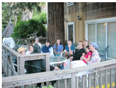
We do let our helpers rest every so often