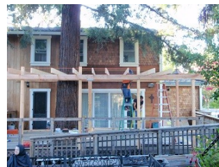
Did anybody notice that there's a tree growing through the middle of the deck?