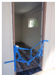
Tape keeps nuns out - but not cats!