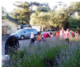
Did anyone remember to bring the scythes?

Just as we were relaxing from a job well done, though, some new friends offered us more lavender than we harvested this entire year! We didn't have the manpower to accept, but they graciously extended the offer for next year. So, if you're not doing anything next July, give us a call. We'll keep you busy!