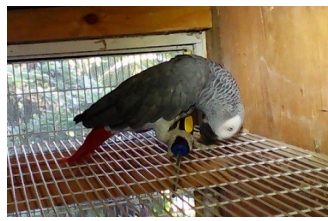
Hmm. Not quite.