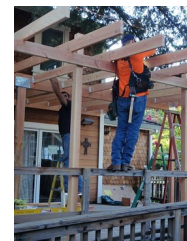
It doubles as exercise equipment!