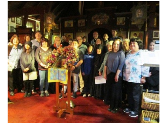
Thanks, everyone! How soon can you come back?