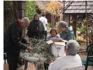
Expert olive harvesters!