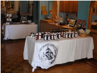
Be right back!

A group from Church of the Redeemer (Palo Alto) came for a work party (olive harvesting) and a short talk on the Saturday after Thanksgiving