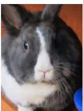
We miss you, Ricochet.