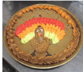
Looking for me?