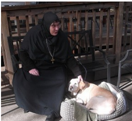
Daisy - the best dog in the universe!