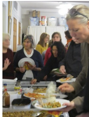
Where's the turkey?