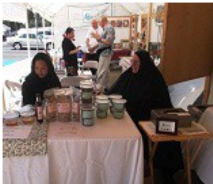
What do you mean, we didn't bring the air conditioner?

This was our FIRST year at St. Demetrios Church. We are very grateful to the members of St. Demetrios, who went out of their way to be kind and helpful. We wish they could have done something about the hot weather, though. Maybe next year!