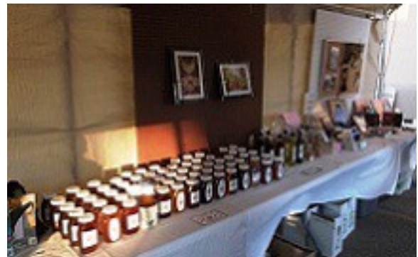
Did we bring enough honey?