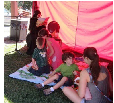
Yes, we're paying attention. HONEST!

This was our SIXTH year at Glendi! In addition to bringing our bookstore, we have the great blessing of helping out in the children's area. It's always a question as to who's having more fun – the children or the nuns!