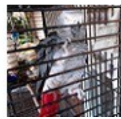
Sunrise: about the grape you promised me ...?