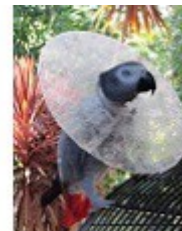
Pearl: Yes, of course, it's my idea to wear this. It's the latest fashion!

As you can see (perhaps!) in the above picture, Sunrise is still in his own cage. We hope to introduce Sunrise into Petie's aviary soon. Of course, WE know that Petie needs a friend, but it remains to be seen if HE knows it! So, stay tuned!