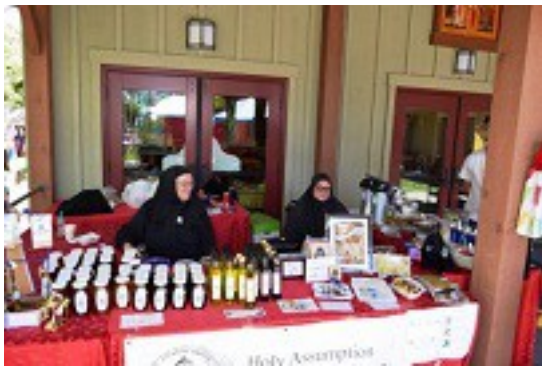
What did we forget THIS time?

Every year, we are blessed with more opportunities to take our bookstore to different churches' festivals. At times, it presents quite a logistical challenge. Last month, the sisters had to figure out how to be in three places at once – St. Seraphim Church's Glendi in Santa Rosa (Sep 19-20), St. Demetrios Church's Greek Festival (Sep 18-20), and at home holding down the fort! We're not complaining – it's a wonderful difficulty to have! Stay tuned for next month's newsletter, when we let you know how we managed THREE festivals plus the home front!