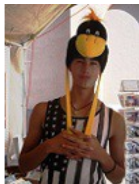
EVERYONE loves the mynah hat!