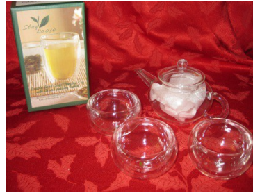
Tea and Teaware