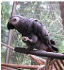
Petie eats an almond: I'll endure anything if properly bribed

Mother Melania and the community of Holy Assumption Monastery