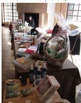
I LIKE this fireplace!