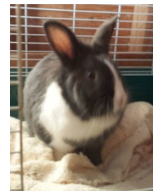
What did I do?

Ricochet and Chiquita, our two bunnies, have also not been best buddies. The fault for this rests squarely on Chiquita, whose Napoleon complex caused her to chase the far bigger Ricochet whenever the two were in the same space. Ricochet would put up with this for awhile, until he'd just had enough. So, we took Chiquita to the vet to be spayed in the hopes this would improve her temper. Later that day, we got a call from the vet's office, informing us that SHE was a HE (which goes far towards explaining why HE bullied a neutered male twice his size). After being neutered, the newly renamed CHIQUITO has come home and shows signs of getting along better with Ricochet.