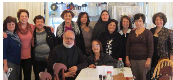
Wait! Four more people want shots taken with THEIR cameras!