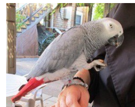
Sunrise - Okay, I think I'm ready to go back in.

We were hoping to report that Petie and Sunrise are now best friends. Our hopes were too sanguine, but at least we can say that they are still sharing the aviary without any major confrontations. This is largely due to Sunrise's peace-loving ways. But we are not without hopes that Petie will, in the long run at least, prove himself amenable to good influence!