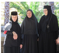
Sunrise: As long as you keep telling me what a good bird I am, you can stay here forever!