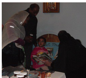
Hey, Mom and Dad. Want to hear a story?