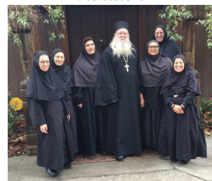
Is it okay to say "Cheese!" on a fast day?