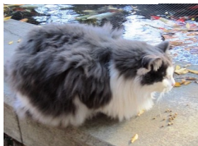
Tin tin tin, save us from the fearsome kitty cat!!

On quite a different note, we finally have a dog! Well, sort of. The sisters have long wanted a dog, but there always seemed to be reasons why that just wouldn't be feasible. So, a friend decided to buy us a dog that we could have no objections to – he doesn't bark, ring up large vet bills, need to eat, etc. Our new mascot, now named Tin tin tin, is firmly ensconced behind the koi pond, where he is a terror to predators (that's our story, and we're sticking to it!)