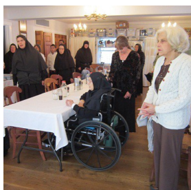
We give thanks to Thee, O Christ our God