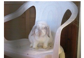
Pulgita – when do I get a rabbit-sized chair?