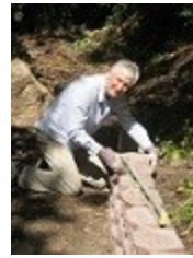
Sometimes you DO have to build walls!