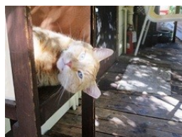
Simba – I saw that!