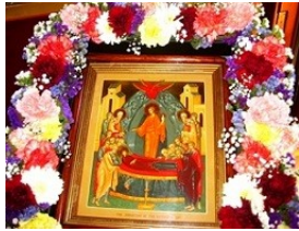
Icon of the Dormition of the Theotokos