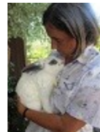
Fiver – there's nothing like a good hug!