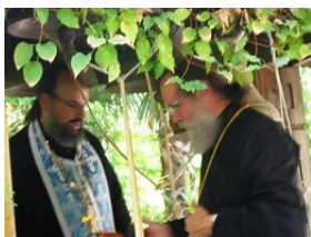
EXPERT Bell Ringers!