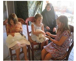
The real bunnies make an appearance