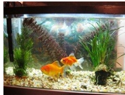
Caesar and Zorro – where shall we swim THIS time?