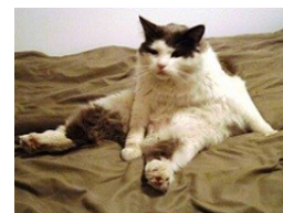
Philly – I bet YOU can't get into this position!