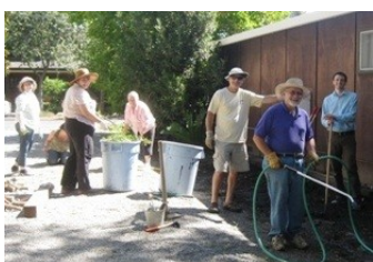
Cleaning up the area behind St Nicholas House