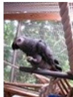
Petie – Pick me up, now!