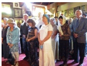
During the Divine Liturgy