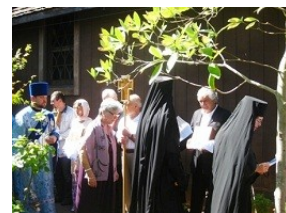
The festal procession