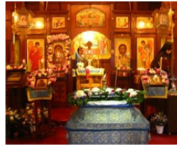
The chapel during vigil