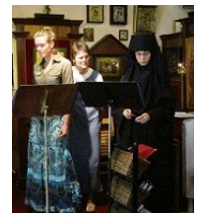
Eis polla eti Dhespota!

Lovely meals and times of fellowship followed both the Vigil and the Liturgy. The sisters are deeply grateful to the many friends who helped in the preparation and serving of food, the care of the grounds, and not least of all, the clean-up after the feast! Following the Liturgy and the meal afterwards, one of the sisters gathered the children and made bunnies out of socks. The children enjoyed their bunnies - particularly because the REAL monastery bunnies, Pulgita and Fiver, came to oversee the process! Many thanks to all who were present for our feast and all who contributed their work and prayers. God bless you!