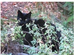
Sticklers – shhh! I'm hiding!!!