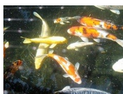
The koi – hey, what happened to the traffic cop?