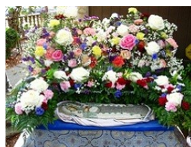
The plaschanitsa (burial shroud) of the Theotokos