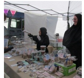
Wait! You forgot to try the chocolate chip cookies!

We finished our first season at the Calistoga Farmers' Market at the end of October. The kindness and friendship of the staff, vendors, and customers has been very humbling and greatly appreciated. We will not be regular participants in the winter market, but we have signed up to be "on-call." We anticipate having our booth there sometime before Christmas and possibly a few other times. In the meantime, Cal-Mart has been selling our Sisters' Choice Granola and Raisin Nut Crunch, and other goodies are available for special order at the monastery itself. Thanks to all who have made our first foray into the Farmers' Market such a wonderful experience!