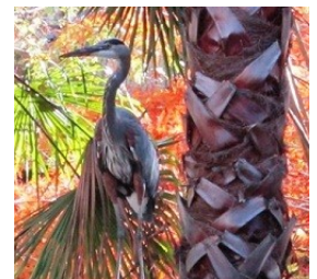
Our heron visitor: Undeniably handsome but not very nice to koi!

Although we have had our share of mishaps with the koi, until now we have never lost one to a predator. This enviable record is largely thanks to the design of the pond, which has a lip that prevents four-footed predators from easily scooping up koi and a cover of trees that hinders the flight of diving birds. Unfortunately, a heron figured out that it could glide in, sit on the side of the pond, and go spear-fishing! Well, herons are beautiful birds, but handsome is as handsome does, and our local herons are now on notice that they will be chased away whenever they try to visit!