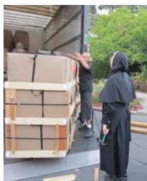
Arrival of caskets

Many thanks to all who have provided funds and expertise to get us started in this venture. We are extremely grateful!