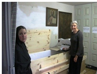
Putting in the lining