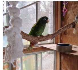
Oscar – Branching out

Oscar has been ensconced in the new aviary for quite some time now, but we just recently have convinced Petie to get into a carrier and explore his section of the aviary. Currently, he is dividing his time between aviary and office. The jury is still out as to which he prefers.