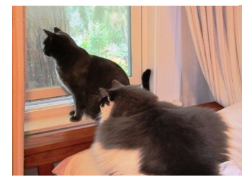
Good job, Balou. I'll take the next shift in another twelve hours or so