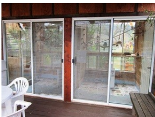
The New Aviary

Oscar has been ensconced in the new aviary for quite some time now, but we just recently have convinced Petie to get into a carrier and explore his section of the aviary. Currently, he is dividing his time between aviary and office. The jury is still out as to which he prefers.