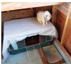
Left – Pulgita has come up in the world!

The koi are fine and always happy to see you (especially if you can convince their caretakers to give you a few extra cheerios to feed them). And the cats? Well, they are still above it all!