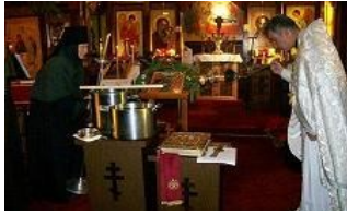
Blessing the Waters