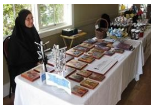
Ready for Action!