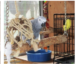
Petie's Idea of Swingtime

Somewhere along the way, it occurred to us that the outdoor enclosure of the aviary would make a lovely home for our bunnies. So, Thumper and Pulgita are now stretching their limbs happily in their new digs.