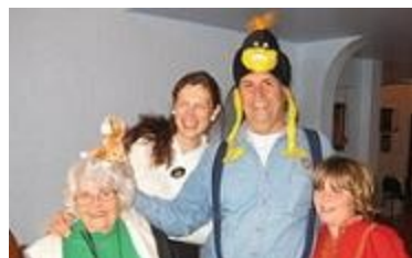
Mimi the Mynah and Capers the Cat pay a visit!