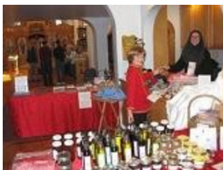
Making sure everything is set up properly

On the weekend of November 10/11, the sisters were invited to bring our bookstore to Ss. Peter and Paul Church, Santa Rosa, for their annual bazaar. We are grateful to our friends there for their graciousness.