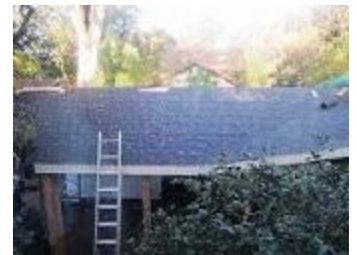
Ready for shingles