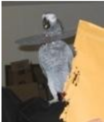
Pearl likes to get her beak into her work!

Pearl the African Grey Parrot visited us again over Thanksgiving weekend. She divided her time between the aviary and the office, where – like Petie – she is always cheerfully ready to help when we need her services as a shredder.