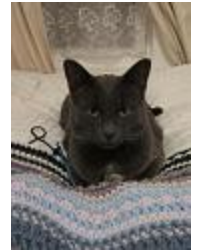
This is MY blanket!