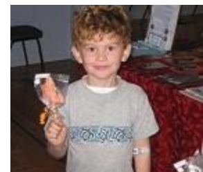
A satisfied customer!