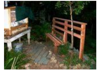
Our new bench!!