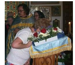
Venerating the icon