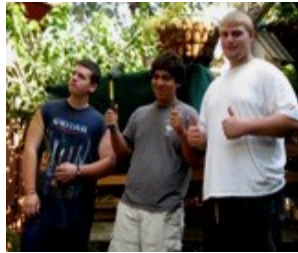
Ready for anything!