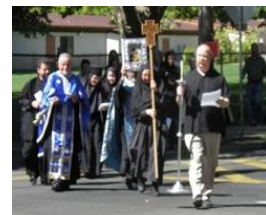
Processing to St. Simeon