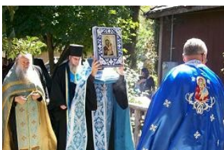
Entering the chapel