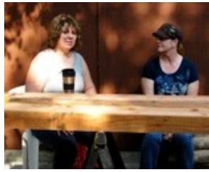
The moms have the final say on quality control