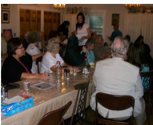
Wait, I can't write that fast!

To do this, we must learn to govern with the attentive mind the two passible powers of the soul - anger and desire. These are not inherently bad (one should be angry over sin and desire God), but become passions when we focus on ourselves and not God. The person with true prayer so governs these powers that his mind is free from thoughts and images connected to the passions.