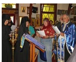
Singing the akathist