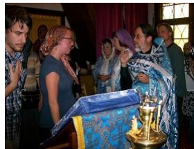
Anointing the faithful