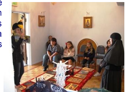
At right – it's so much easier to tell a story when you get into character!!