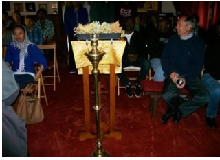
On November 3, the Ministry Colloquium Class from Pacific Union College in Angwin visited us. We enjoyed the discussion, and they enjoyed the koi!

There doesn't seem to be enough room in this month's newsletter to say much about the various things that are going on. So, we thought the best approach was just to show some pictures. Enjoy!