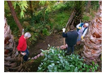
Our intrepid friends from St. Seraphim Church finished working on the low wall and path in the lower garden.