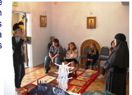
At right – it's so much easier to tell a story when you get into character!!