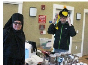
The mynah hat makes another appearance!