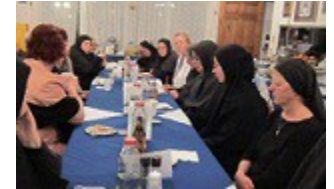
A sea of black - mostly

To reverse this, we need to make God our first priority, to love Him with all our heart, soul, strength, and mind and our neighbor as ourselves. But how do we do that? Through thankfulness for God's love and gifts, but also for our sufferings. Through following the life of the Church – the daily cycles of services, prayer, fasting, almsgiving, Bible reading ... With the help of others on the same path. Slowly and patiently, as the abbot said: “We fall and get up, fall and get up, fall and get up.”