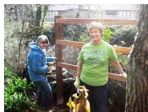
Hey, we're getting good at this!