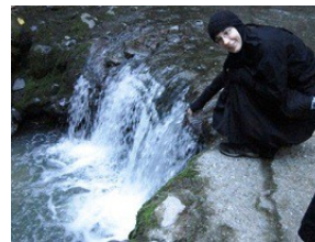
Shall we dive in?