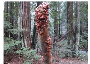
A ladybug convention!

Once again, we were invited by St. Seraphim Church to take our bookstore to their January 2 Feast Day. Many thanks!!