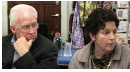
Hmm, let me think about that one!

O wise one, thou didst greatly desire to behold and worship at the sepulcher of the Ever-existing One; and while there thou didst in holy manner conceive the thought of dying, through abstinence, with Him Who in His loving-kindness allowed Himself to be slain, O venerable one.