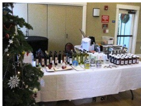
Ready for business!