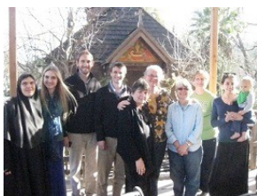
A hard-working crew!

Some of the sisters and a friend or two took a stroll up Old Lawley Toll Road and found – among other things – a lovely waterfall and a bunch of ladybugs trying to stay warm.