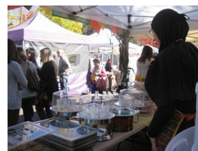
We could use some customers over here!