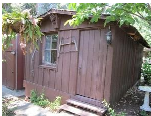
The 'fish shed' – future home of our icon-mounting studio