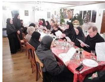
Singing Christmas carols