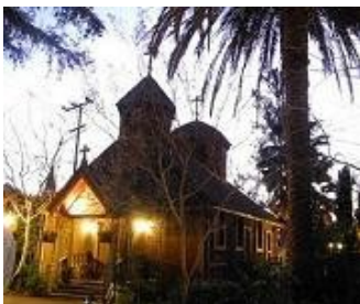
Prepare to receive Christ!