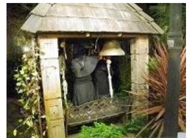
Ring the bells