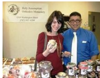
At St. Timothy Church