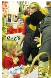
Which shall we choose? See's Candies or a Mynah Hat?