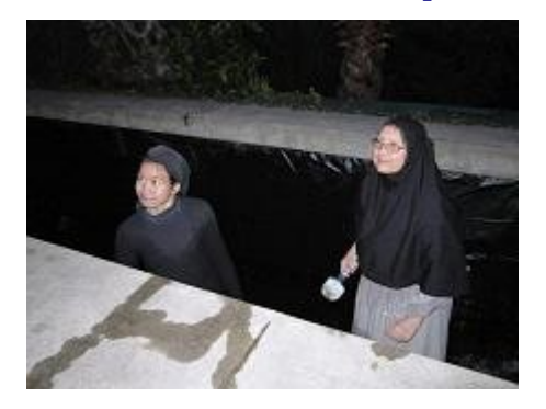
Yes, of course, this is our favorite job!

Our koi pond was in need of some maintenance that required a major drain. So, a few of our intrepid sisters braved the cold, took care of the problem, and made the koi very happy!