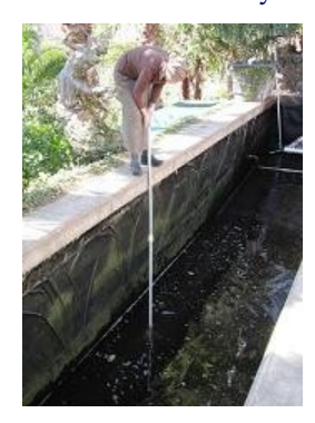
A novel way to practice one's golf swing!