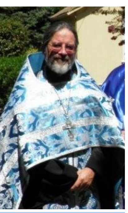
4:00 PM – Presentation

Ss. Peter and Paul Church, Santa Rosa, CA