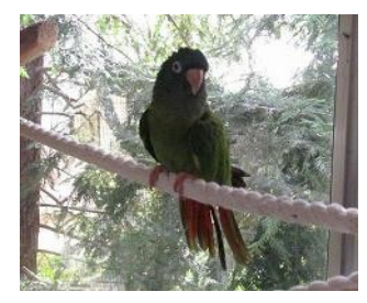
Hey! Who's that?