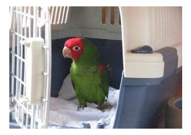
That's much better, thank you!