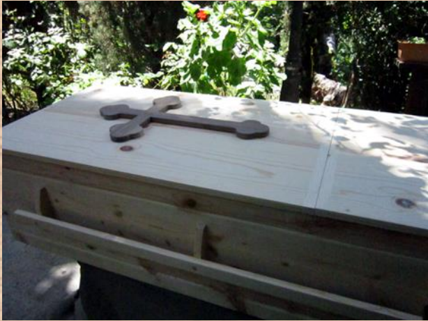
PINE CASKET: $ 1,000

Flat lid, simply lined with a poly-cotton blend fabric. Includes mattress pillows and optional Cross.